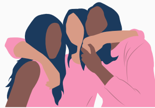
Creating a support system