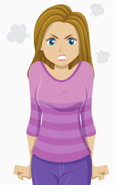
Responding instead of reacting