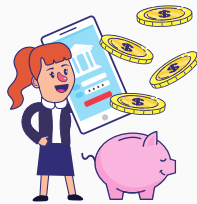
Creating a financial plan