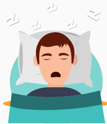
Getting enough sleep